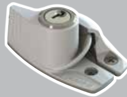
Sash Window Locks