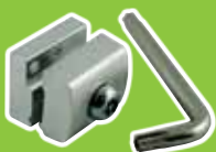
G70 awning stop & G10 sash fasteners