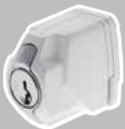
Mini Vent Lock